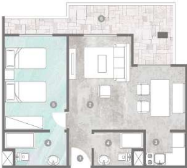
1 BEDROOM CORNER FRONT 66m 2 indoor+ 17m 2 outdoor