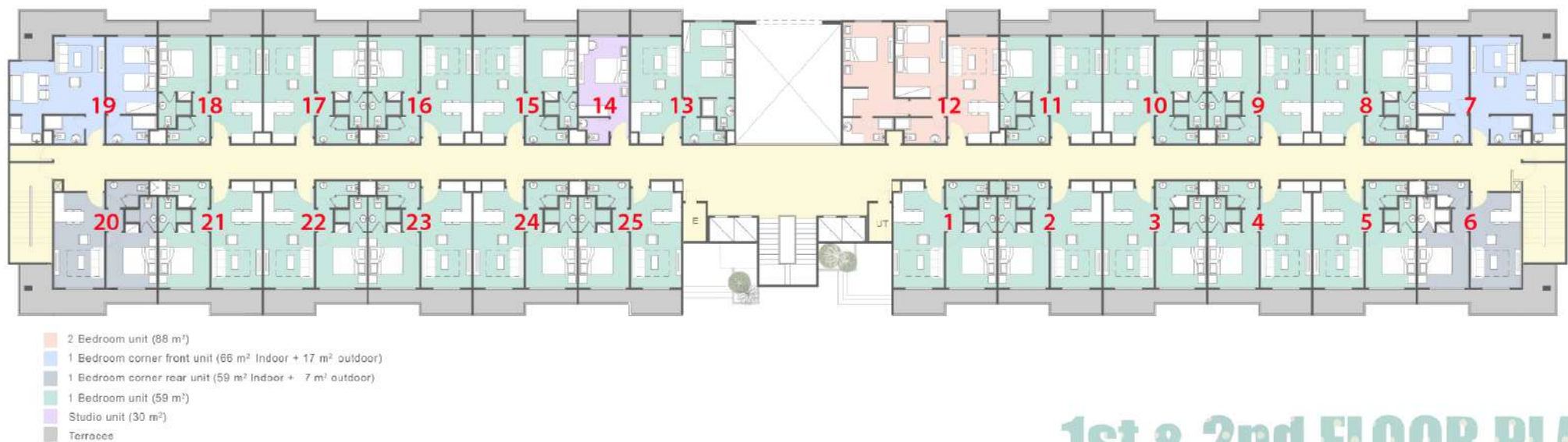
1st & 2nd FLOOR PLAN

P O R T O W A L K - G O L F P O R T O M A R I N A